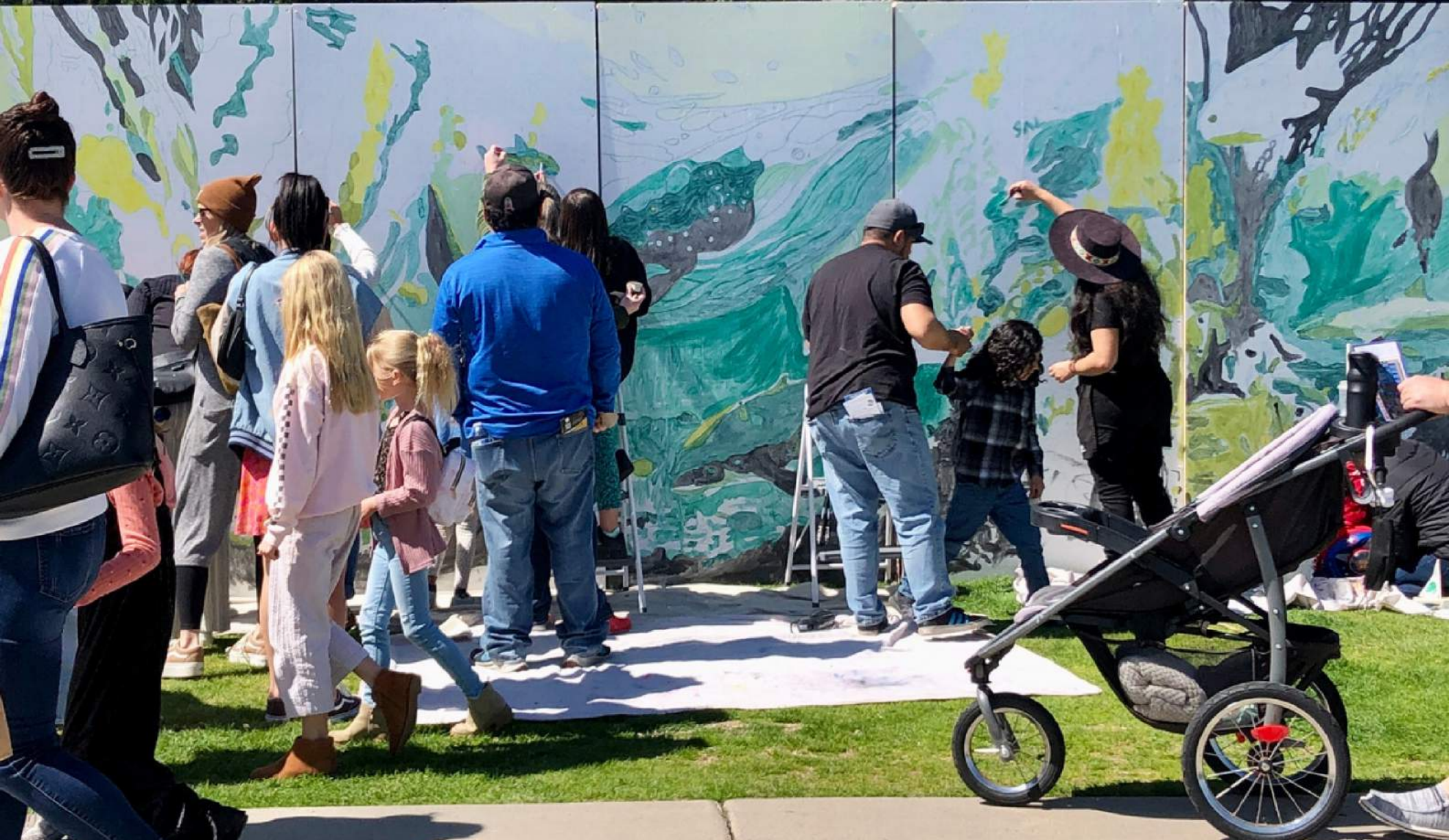
Hundreds participate in OPAC's "Celebration of the Whales" Paint-By-Numbers Mural.